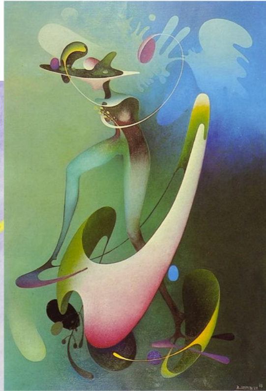
Vangel Naumovski Pearls of Youth, 1973